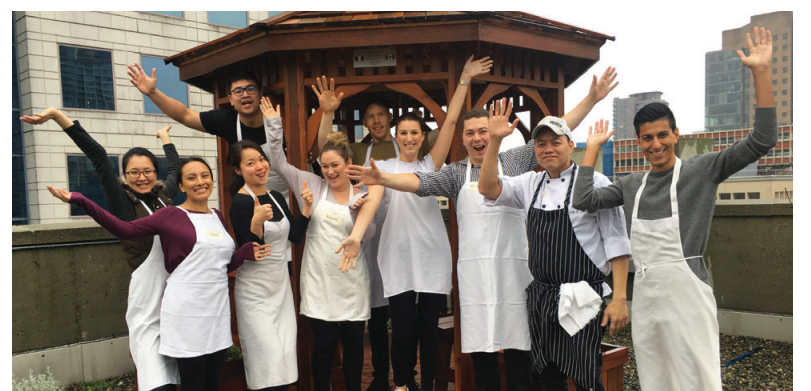
Members of the Greater Vancouver Board of Trade's under-35 program, the Company of Young Professionals, spent the day volunteering at Salvation Army Belkin House on Dec. 8. Learn how to get involved at boardoftrade.com/cyp .

Did you know the Greater Vancouver Board of Trade hosts nearly 130 speaker events, seminars, webinars, and networking receptions each year?