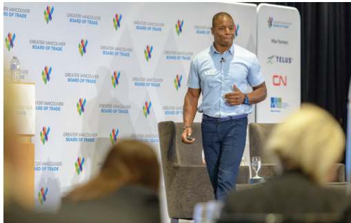
Award-winning fitness coach, Grey Cup champion, and TV host Tommy Europe motivates attendees at Work + Wellness Forum 2018 on Oct. 12.