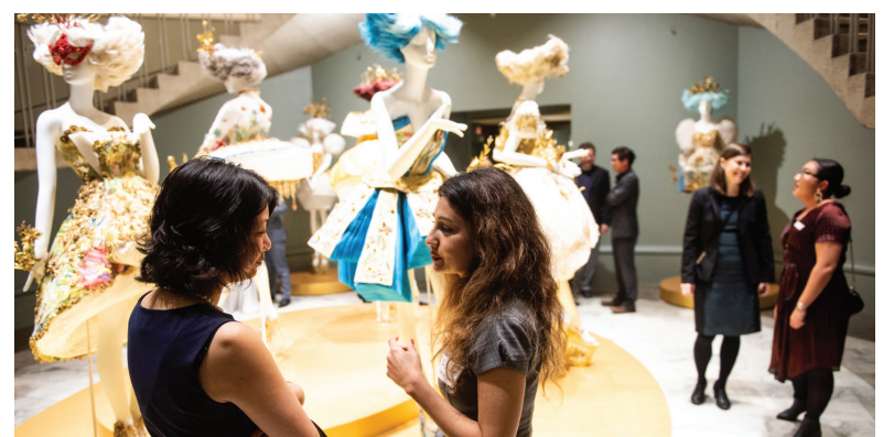
Members of the Greater Vancouver Board of Trade's four Signature Programs had the rare opportunity to go behind the scenes at the Vancouver Art Gallery on Dec. 3 as part of 'A Merry Little Holiday Social.'