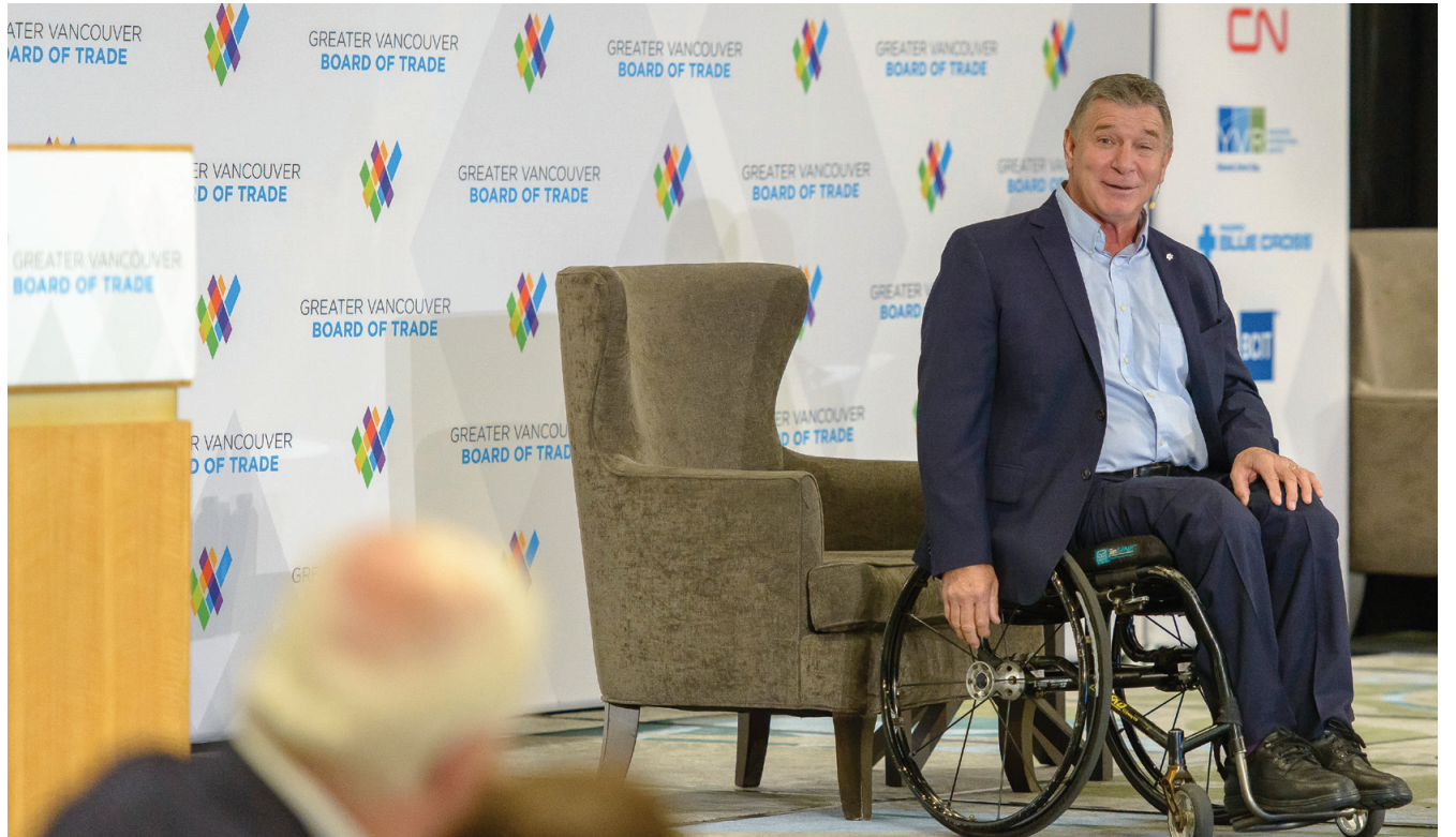
The Man in Motion Rick Hansen delivers the luncheon keynote address at the Greater Vancouver Board of Trade's Work + Wellness Forum presented by Pacific Blue Cross. In his remarks, Hansen spoke about how businesses in our region can remove barriers for people with disabilities, unleashing their full potential and strengthening British Columbia's economy. Hansen was one of 19 speakers who took the stage over the course of the half-day forum. Learn more at boardoftrade.com/wellness.